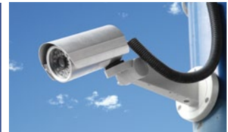
Outdoor IP Camera