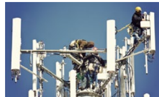
Outdoor AP / CPE + Data Collector