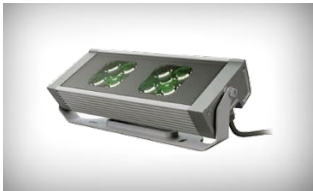
LED Wall Washer