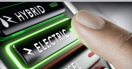
Hybrid Electric Vehicle