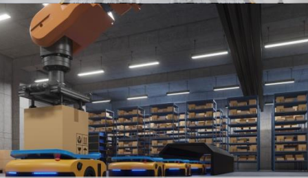
Lift & Material Handling